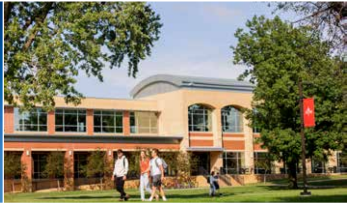
North West Rural Electric Cooperative received a $1,000,000 loan to help fund a pass-through loan to Northwestern College to build a residence hall on the Orange City campus.