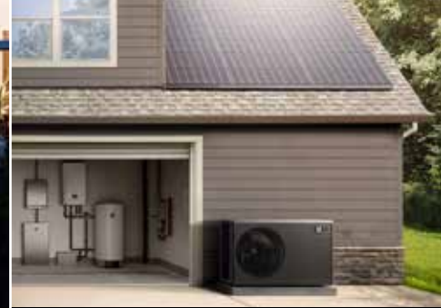
Some battery-powered systems are constantly charged by the power grid, while others rely on solar panels for recharging.

That makes them safer and more environmentally friendly than generators. Most can be installed in a small space indoors. Battery backups are also significantly quieter.