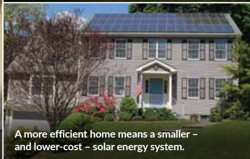
A more efficient home means a smaller – and lower-cost – solar energy system.