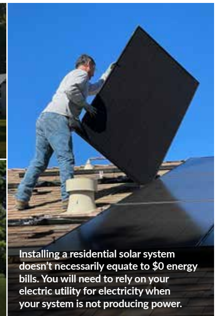
Installing a residential solar system doesn't necessarily equate to $0 energy bills. You will need to rely on your electric utility for electricity when your system is not producing power.