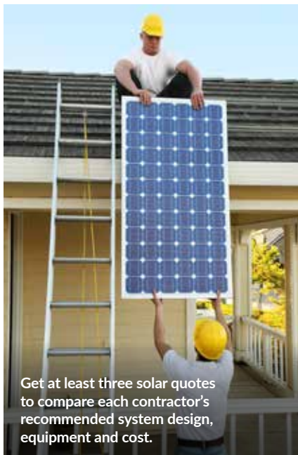
Get at least three solar quotes to compare each contractor's recommended system design, equipment and cost.