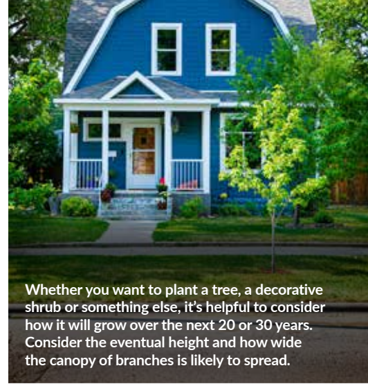
Whether you want to plant a tree, a decorative shrub or something else, it's helpful to consider how it will grow over the next 20 or 30 years. Consider the eventual height and how wide the canopy of branches is likely to spread.