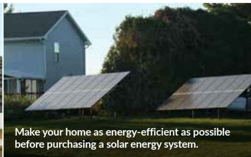
Make your home as energy-efficient as possible before purchasing a solar energy system.