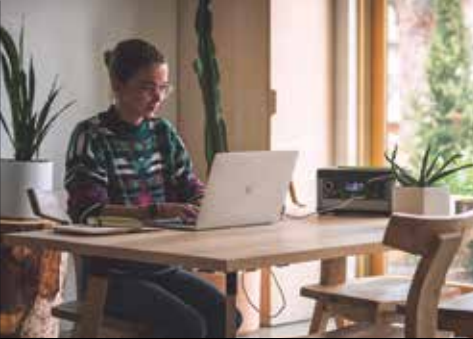
Portable battery-powered backups can be used indoors to power smaller appliances, like your laptop, TV or microwave.