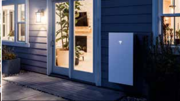
As their name implies, battery backup systems like Tesla's Powerwall are essentially high-capacity batteries that store a set amount of electricity, which you can then use to power your home in the event of an outage.