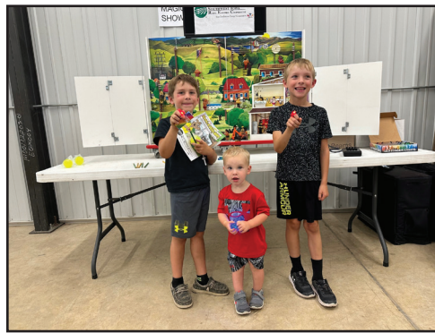
Montgomery County Fair kids