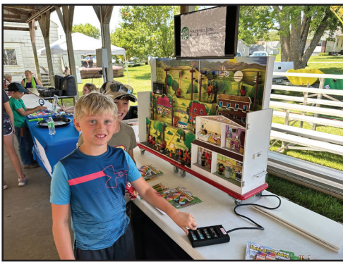
Adams County Fair kids